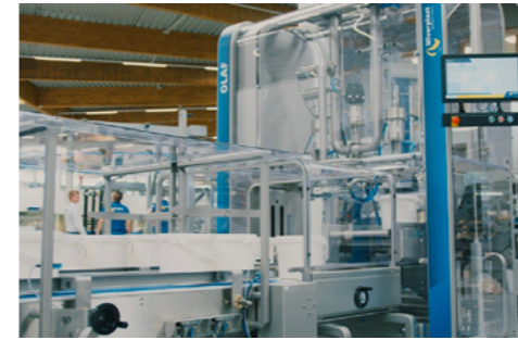
1 Box or bucket infeed