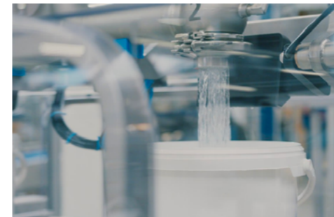
3 Start gross filling