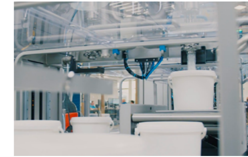
2 Lifting and tare weight correction