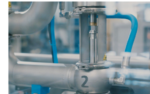
4 Fine dosing