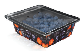
SOFT FRUIT | BOARD

for more information UK +44 (0) 1625 856 600 America +1 804 447 9038 Australia +61 (0) 3 9397 0955