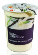
PUDDINGS | A-PET