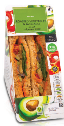
SANDWICHES | BOARD