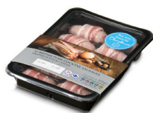
PORK | C-PET