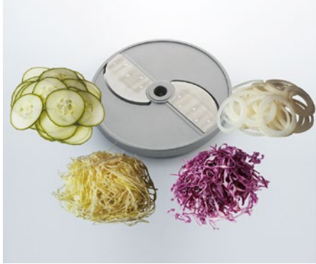
Fine cut (F)