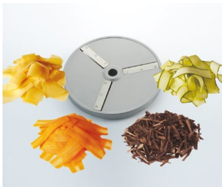
Shaving cut (HS)