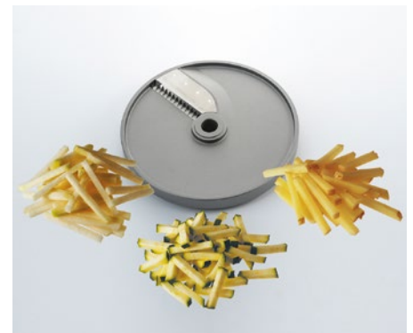
Vegetable sticks (BT)