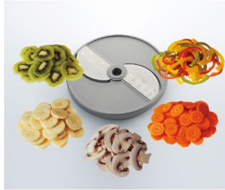
Coarse cut (G)

G3 3 mm G6 6 mm G10 10 mm G4 4 mm G8 8 mm G12 12 mm G16 16 mm