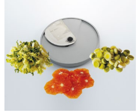
Tomato slicer (TO)

G3 3 mm G6 6 mm G10 10 mm G4 4 mm G8 8 mm G12 12 mm G16 16 mm