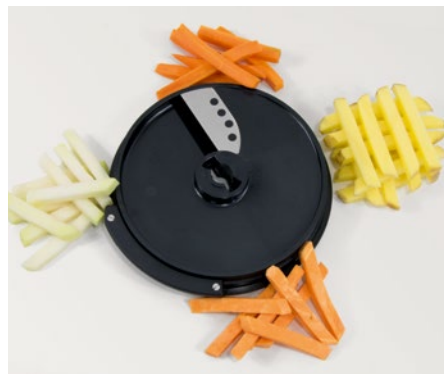
French fries cutter (PF)