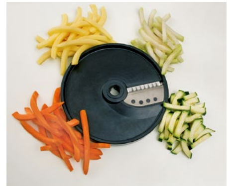
Vegetable sticks (BT)