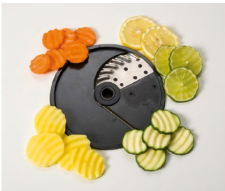
Wave cut (SU)